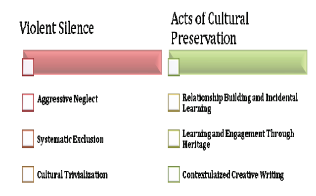
Figure (2): Findings

The analysis also indicated that Asian Indian American students' 'funds of knowledge' are neglected, excluded, trivialized and hence these students rely on out-of-school cultural performing arts (dance and music) to become culturally competent and thereby preserve their culture. This act of preserving culture happens through relationship building, heritage engagement, and creative writing. The following figure illustrates the two steps (see figure: 2 below).